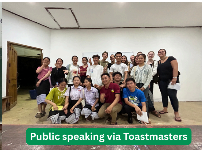
Public speaking via Toastmasters