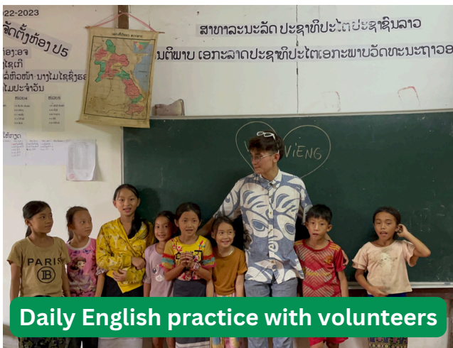
Daily English practice with volunteers