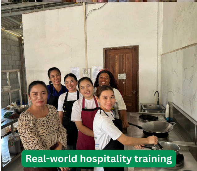
Real-world hospitality training