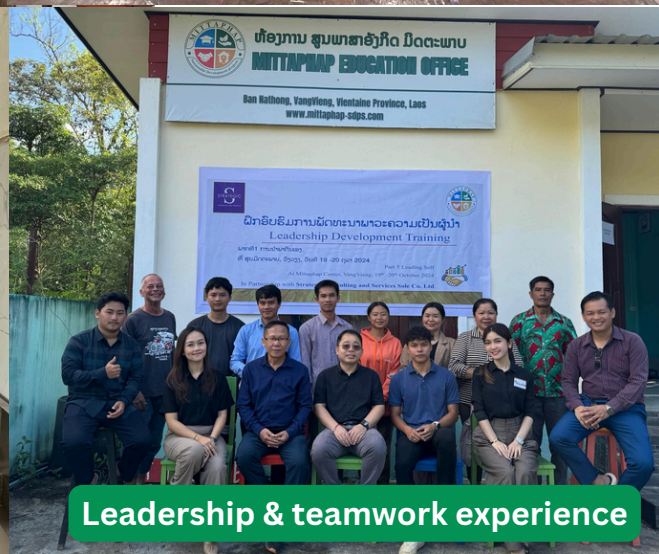
Leadership & teamwork experience